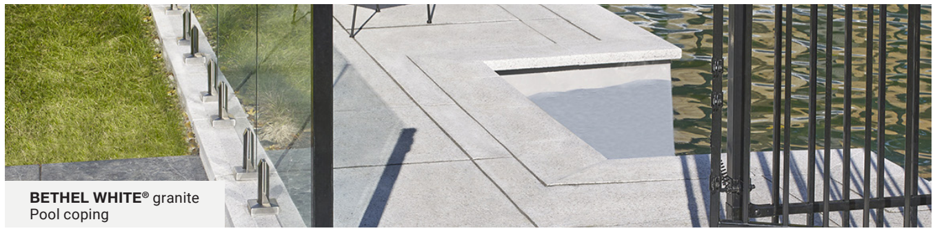
BETHEL WHITE® granite Pool coping

A complement to the surrounding landscape, natural stone pool coping is as practical as it is attractive. Natural stone is durable and resists to freeze-thaw cycles.